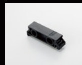
Compatible installation tool for SC OPTION SC-BUX10

This end unit can change and check the settings of sensor amplifiers that allow optical communication and monitor operation status.