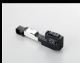
Cascading connector unit SC-71

Used to install SC-T8J/SC-MIL-S to the SC-GU3-03. 10 pcs. per set