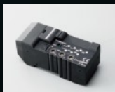
Communication unit for EtherCAT SC-GU3-03

Main communication unit which converts the data received from any attached sensors to communication data for EtherCAT networks.