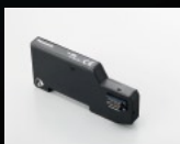
End unit SC-GU3-EU

Used to fix the entire SC-GU3 stack to a DIN rail for reliable performance. Highly recommended. 2 pcs. per set