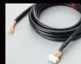
Connection cable OPTION CN-M20-C2

This one-touch connector is used to connect the following devices to SC-GU3-03: The FX-500/400/300 fiber sensor, the LS-400 laser sensor, the DPS-400 digital pressure sensor, SC-T1J and SC-T1JA, etc.