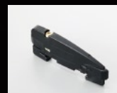
End plate MS-DIN-E

Main communication unit which converts the data received from any attached sensors to communication data for EtherCAT networks.